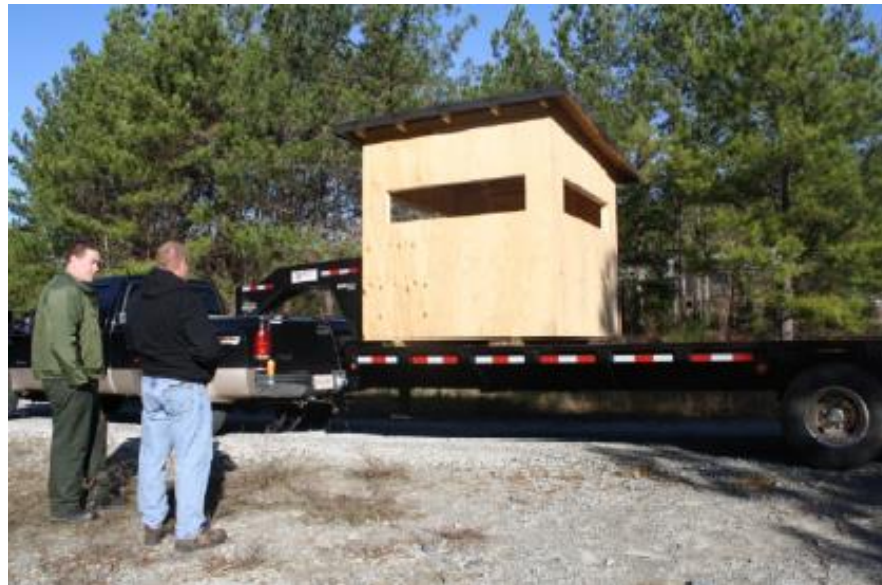
Richard B Russell/Outdoor Dream Foundation Hunting Blinds