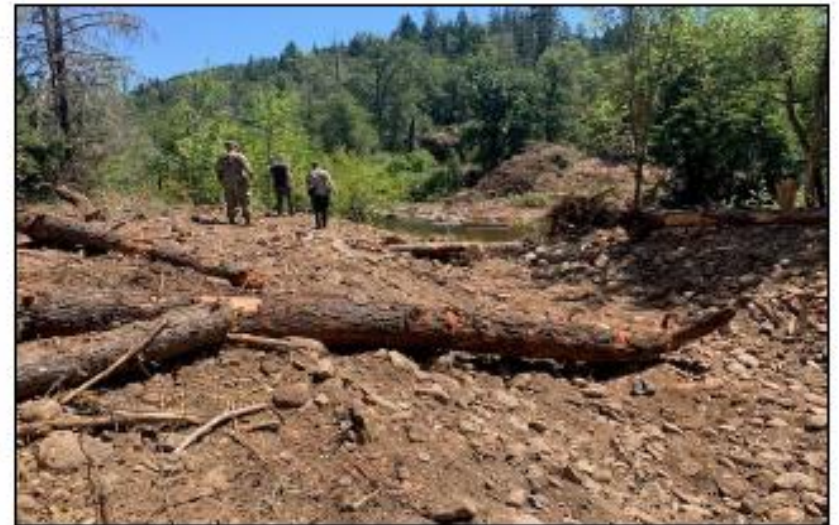
Side channel excavation with large woody debris. Logs donated by BLM and Hancock Timber- salvage from 2018 Miles wildfire that burnt 200+ ac in Elk Creek.

Community Impact: Interpretive signage was created to convey the importance of this ecosystem restoration project. Use of non-marketable timber salvaged from the 2018 Miles Wildfire that impacted over 52,000 ac in the local community.